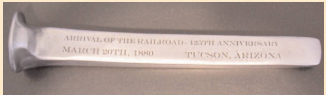
Limited edition (125 made) Commemorati H 6LOU 6SLIN $25.00