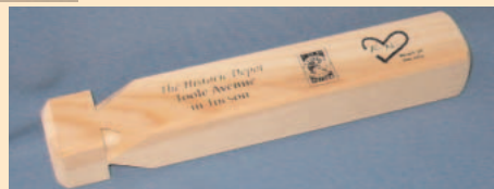
Historic Depot four-tone whistle $5.00