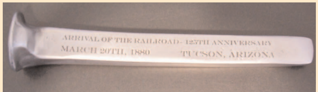
Limited edition (125 made) Commemorative 'Silver' Spike $25.00