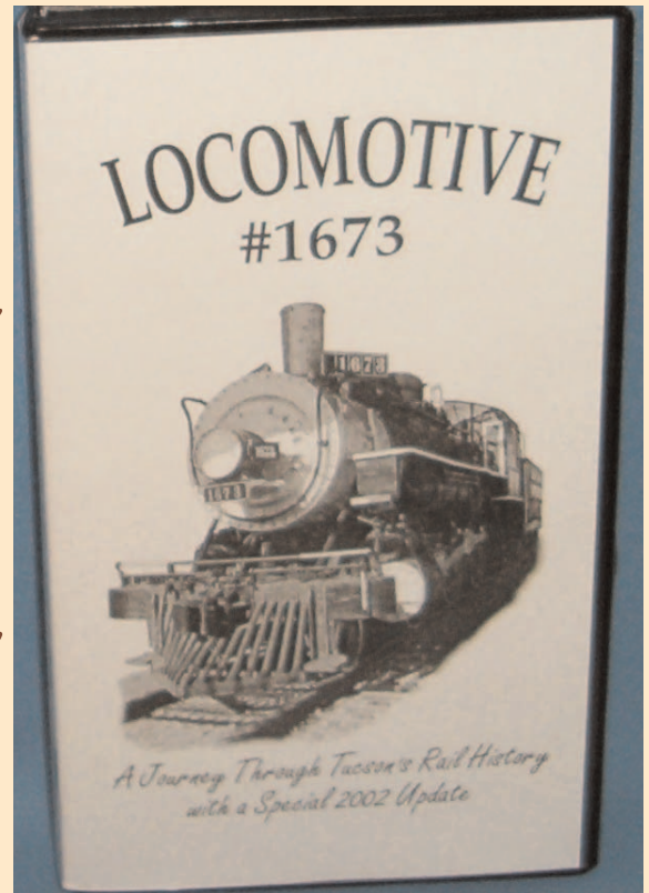
$ -R UH UR J 7 VR V5DLOLRU DG H Unique History of Locomotive #1673 $20.00

Much more available in store including; duds, music cds, t-shirts, calendars, magazines and postcards!